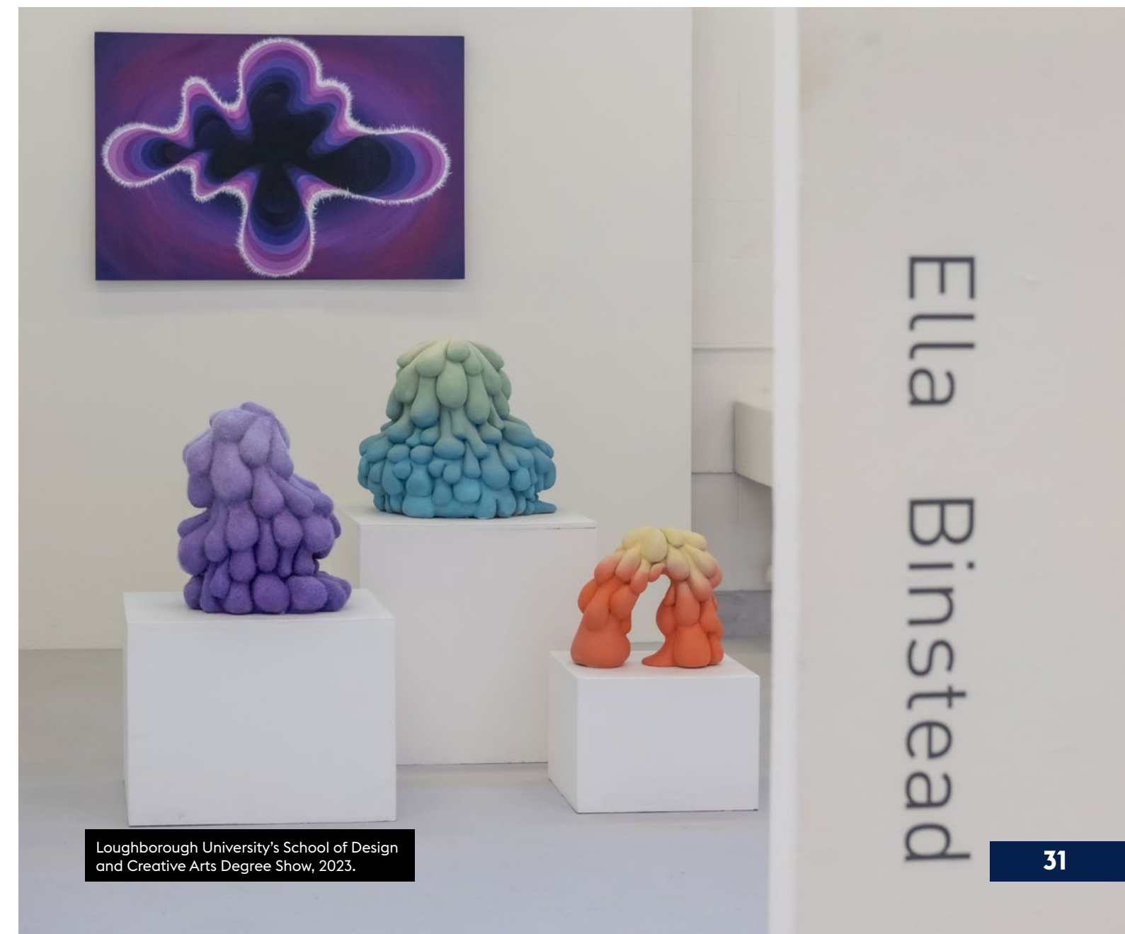
Loughborough University's School of Design and Creative Arts Degree Show, 2023.