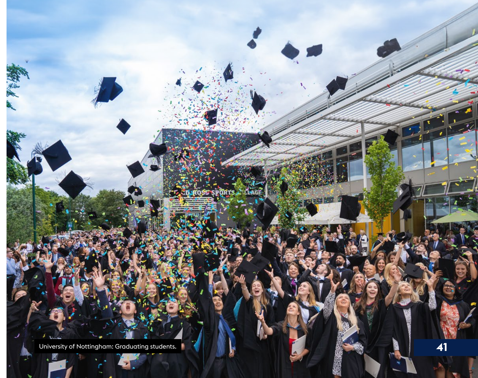
University of Nottingham: Graduating students.

Creative Futures is a gateway between the University of Warwick and the region's creative industries. The centre delivers impact through various programmes and initiatives including a creative industries network, a start-up incubator, digital skills programmes and a state-of-the-art Esports Centre on campus. Since its inception, the centre has provided nearly £1.5 million in sales, grants and commissions, creating 35 jobs, supporting 30 businesses, and taking on 85 new clients.