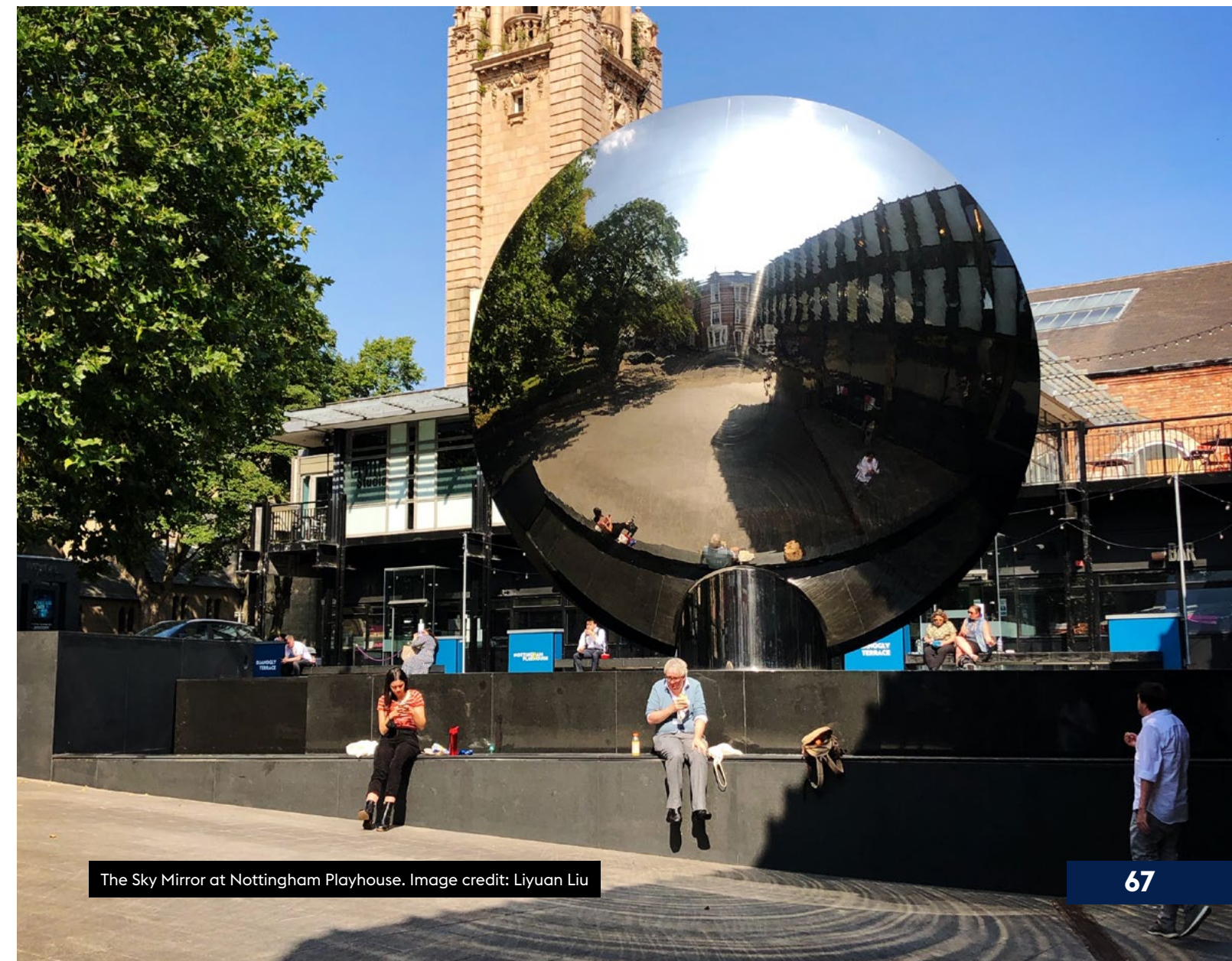
The Sky Mirror at Nottingham Playhouse.