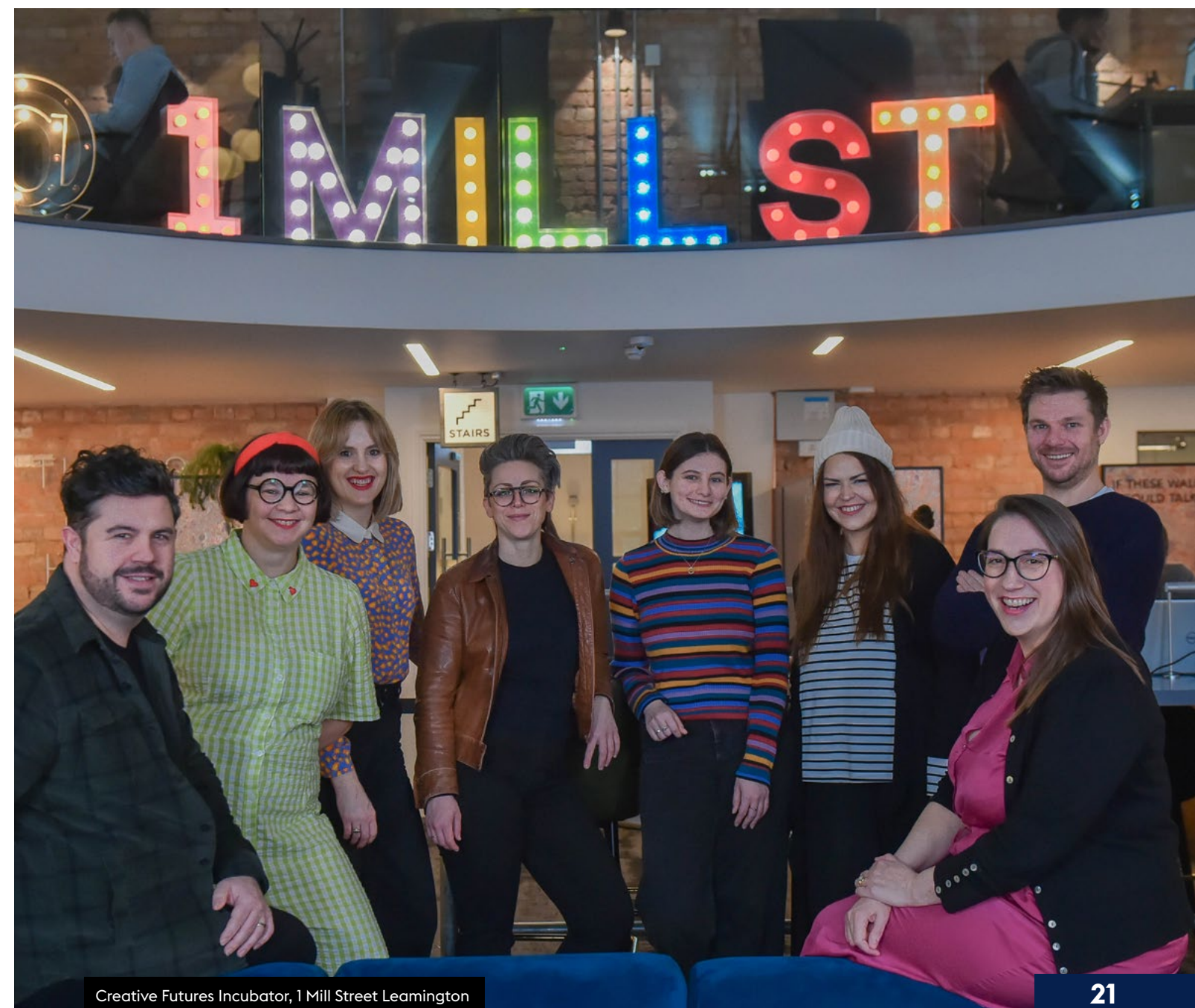
Creative Futures Incubator, 1 Mill Street Leamington