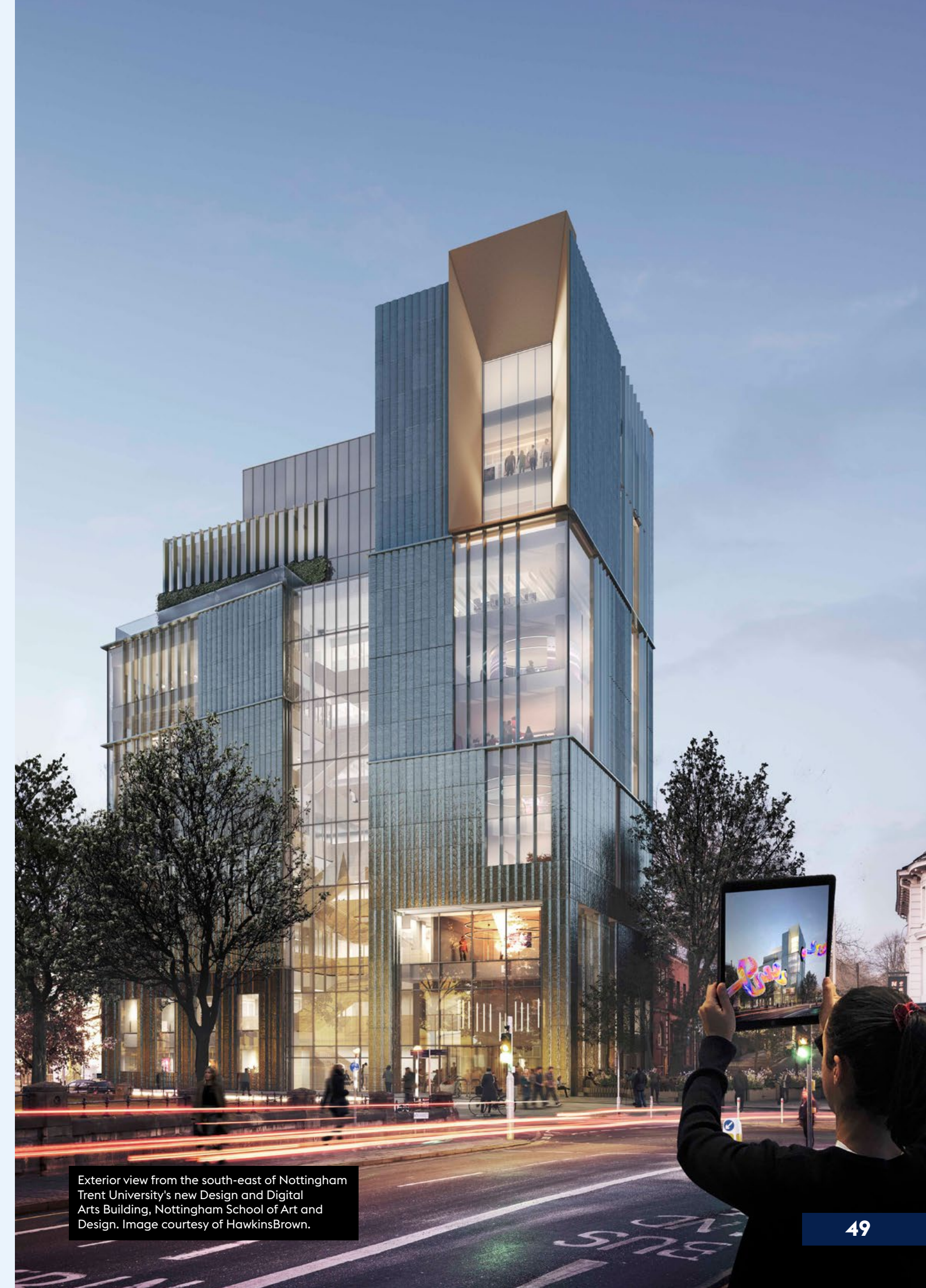
Exterior view from the south-east of Nottingham Trent University's new Design and Digital Arts Building, Nottingham School of Art and Design.