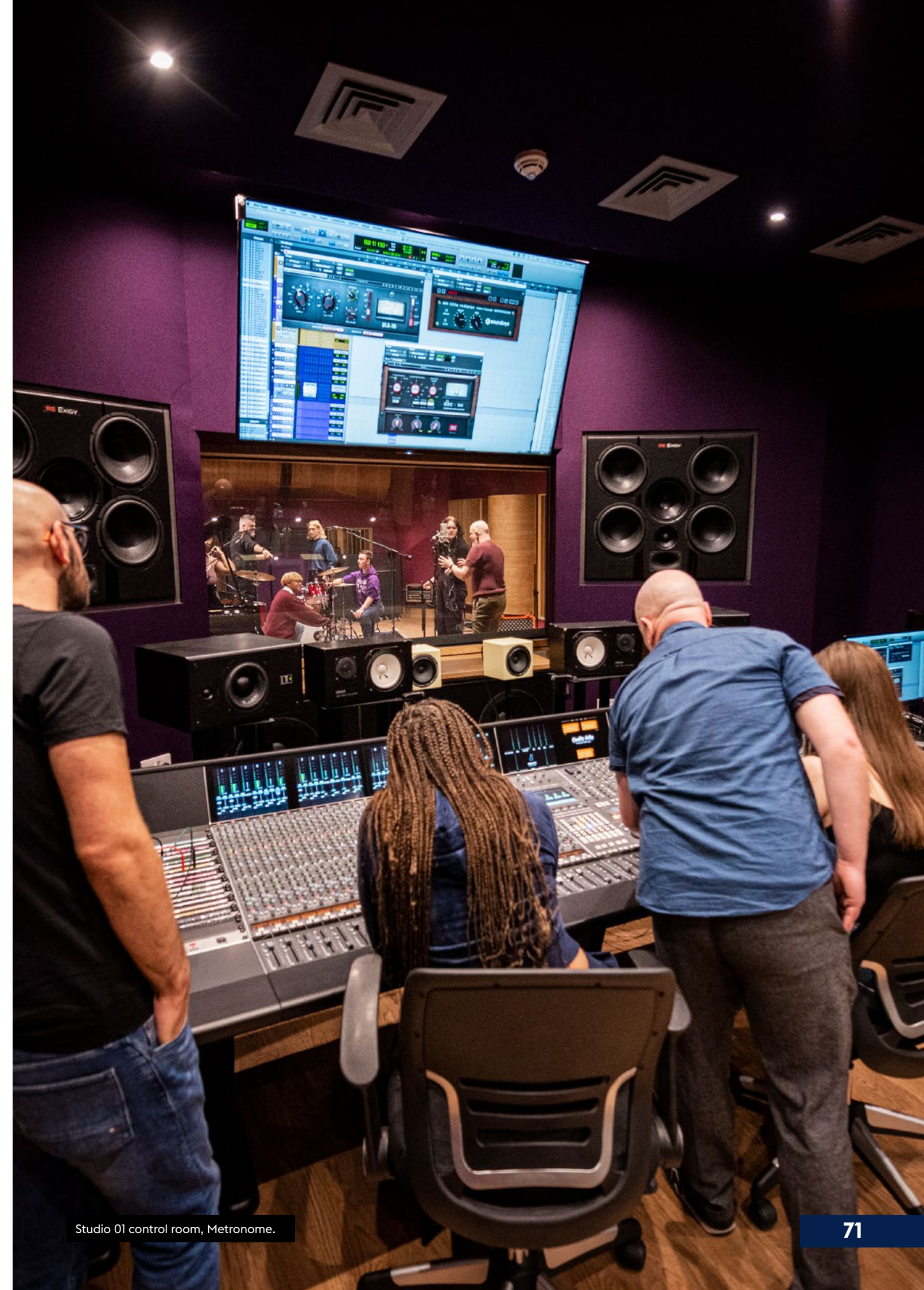
Studio 01 control room, Metronome.