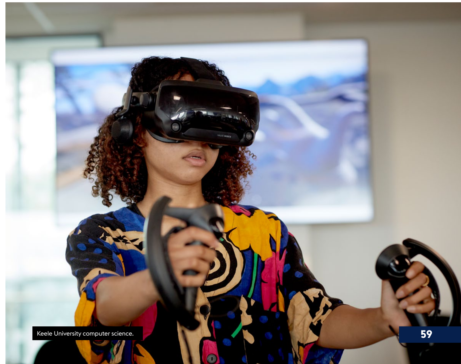
Keele University computer science.