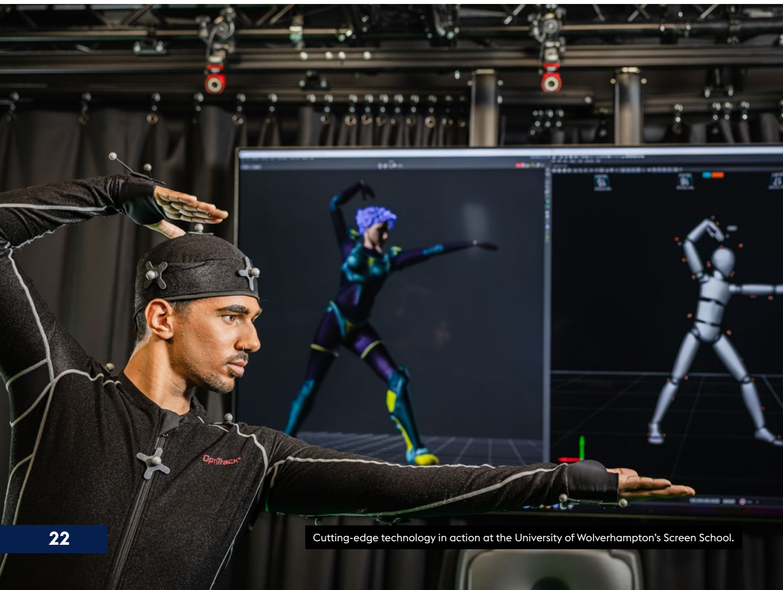
Cutting-edge technology in action at the University of Wolverhampton's Screen School.

Immersive technology is often associated with the use of a specific technology, like Augmented or Virtual Reality (AR and VR) but also includes 3-D, spatial sensing and interactive experiences.