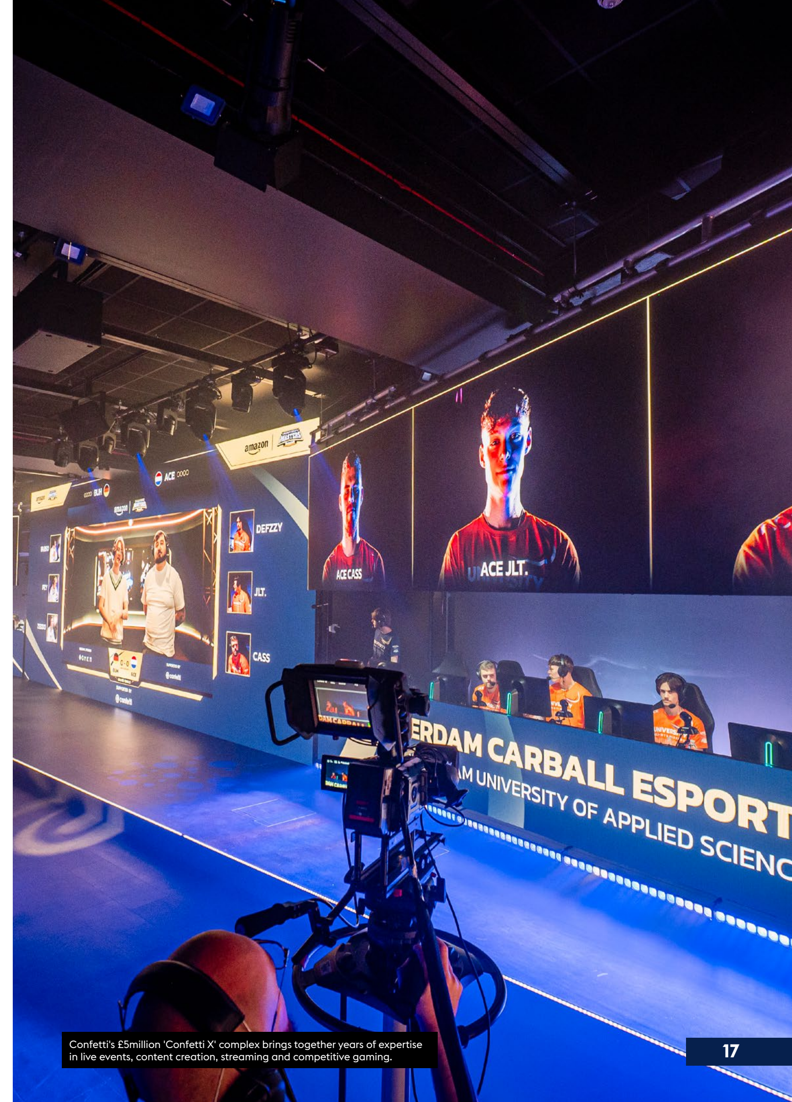
Confetti's £5million 'Confetti X' complex brings together years of expertise in live events, content creation, streaming and competitive gaming.